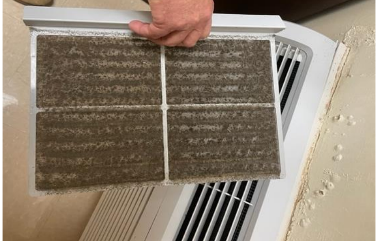
Hope Centennial Elementary