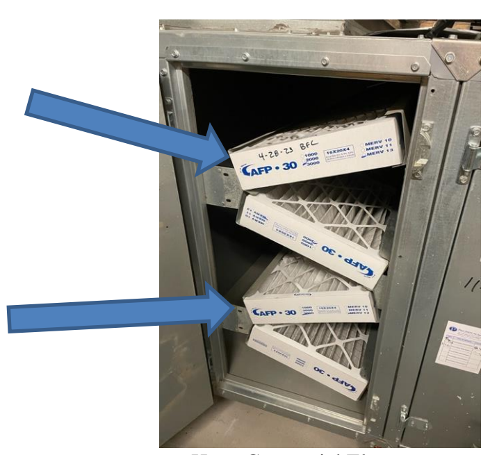
Hope Centennial Elementary

Only one of the filters with the date of service written or stamped on the filter