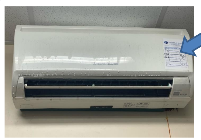
Pine Jog Elementary