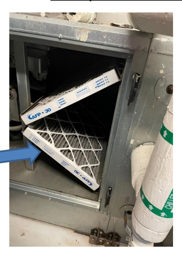
Pahokee High Filters Replaced without the date of service written or stamped on each filter