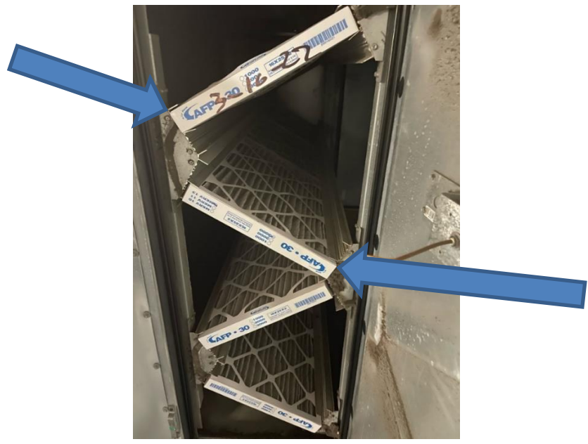
Seminole Trails Elementary

Only one of the filters with the date of service written or stamped on the filter